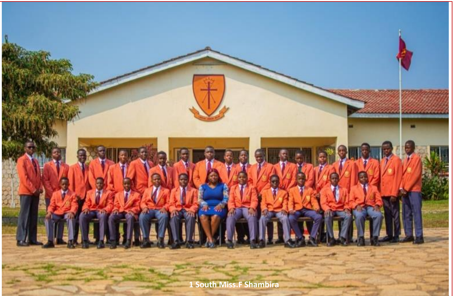
1 South Miss.F Shambira