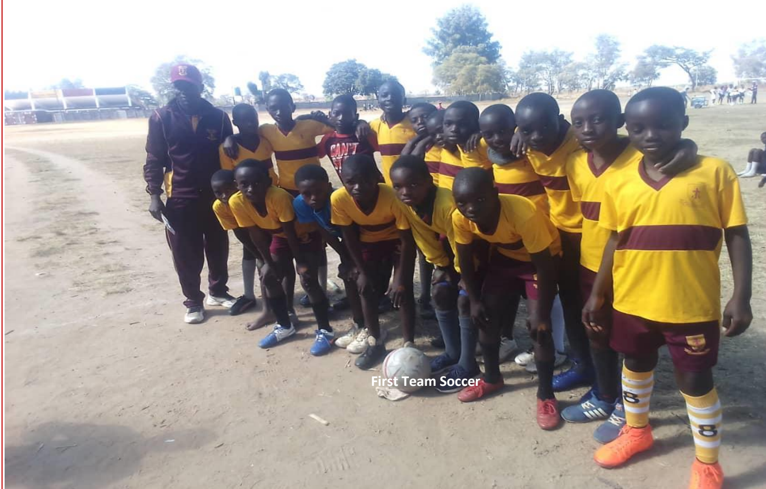
First Team Soccer