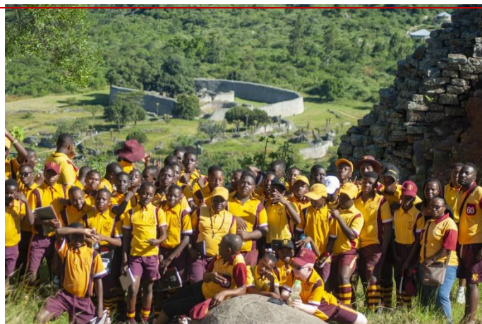
Form 3s at Great Zimbabwe